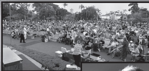
You're there somewhere