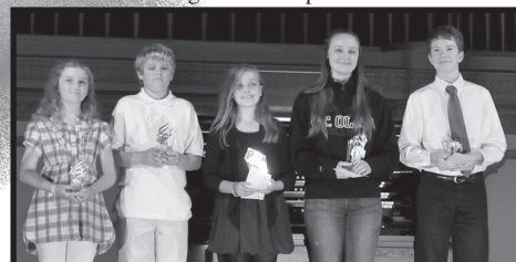
Young Scholarship and Award Winners