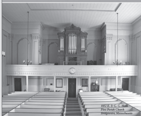
1832 E. & G. G. Hook First Parish Church Bridgewater, Massachusetts

PRODUCED BY THE ORGAN HISTORICAL SOCIETY