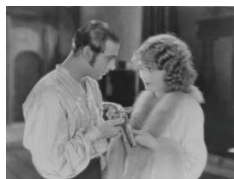
with Vilma Banky