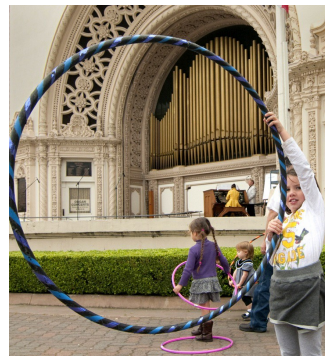
Family Festival Day coming on Halloween weekend! Sunday October 27

Non-Profit Organization U.S. Postage PAID San Diego, CA Permit #2775