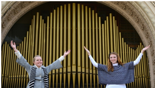
Inside: your invitation to a special brunch, concert, and Insiders Tour!

Non-Profit Organization U.S. Postage PAID San Diego, CA Permit #2775