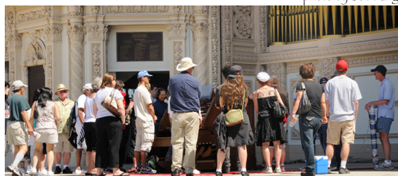
People around the organ after a Sunday concert